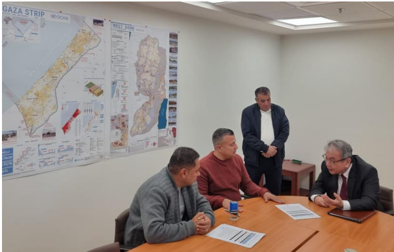
Arraneh Local Council

Abraj House, 8th Floor, 15 Tokyo Street, Ein Monjed, Ramallah Tel: +970 (2) 298-3370/1 Fax: +970 (2) 298-3313 repjapan@rm.mofa.go.jp www.ps.emb-japan.go.jp