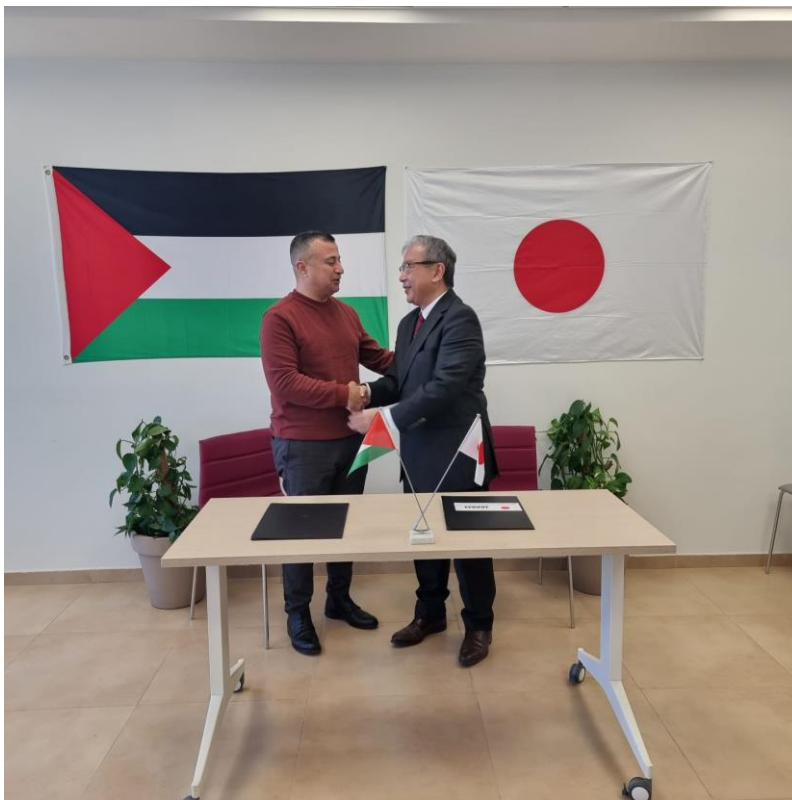
Arraneh Local Council